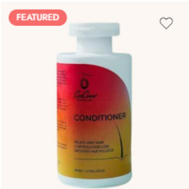
CooCoon Keratine boost Hair ... ₹599.00