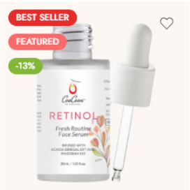
CooCoon Fresh Routine Retino... ₹799.00 ₹699.00