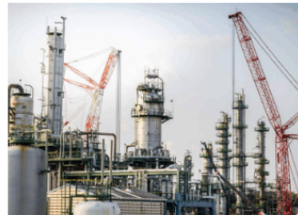
Industrial Plants Construction