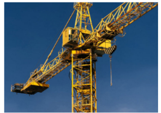
Infrastructure and civil works construction