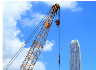
Construction of all types of buildings